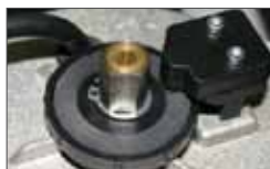
Mechanical twin-disc clutch