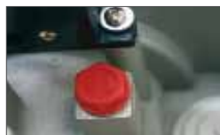
SATURN OIL versions with oil lubrication of the gears for max duration