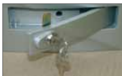
Release with aluminium lever and lock

* Duty Cycles depend on gate size and installation